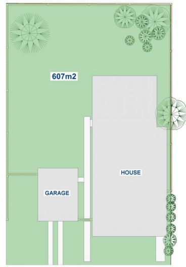
23 VALE STREET SITEMAP