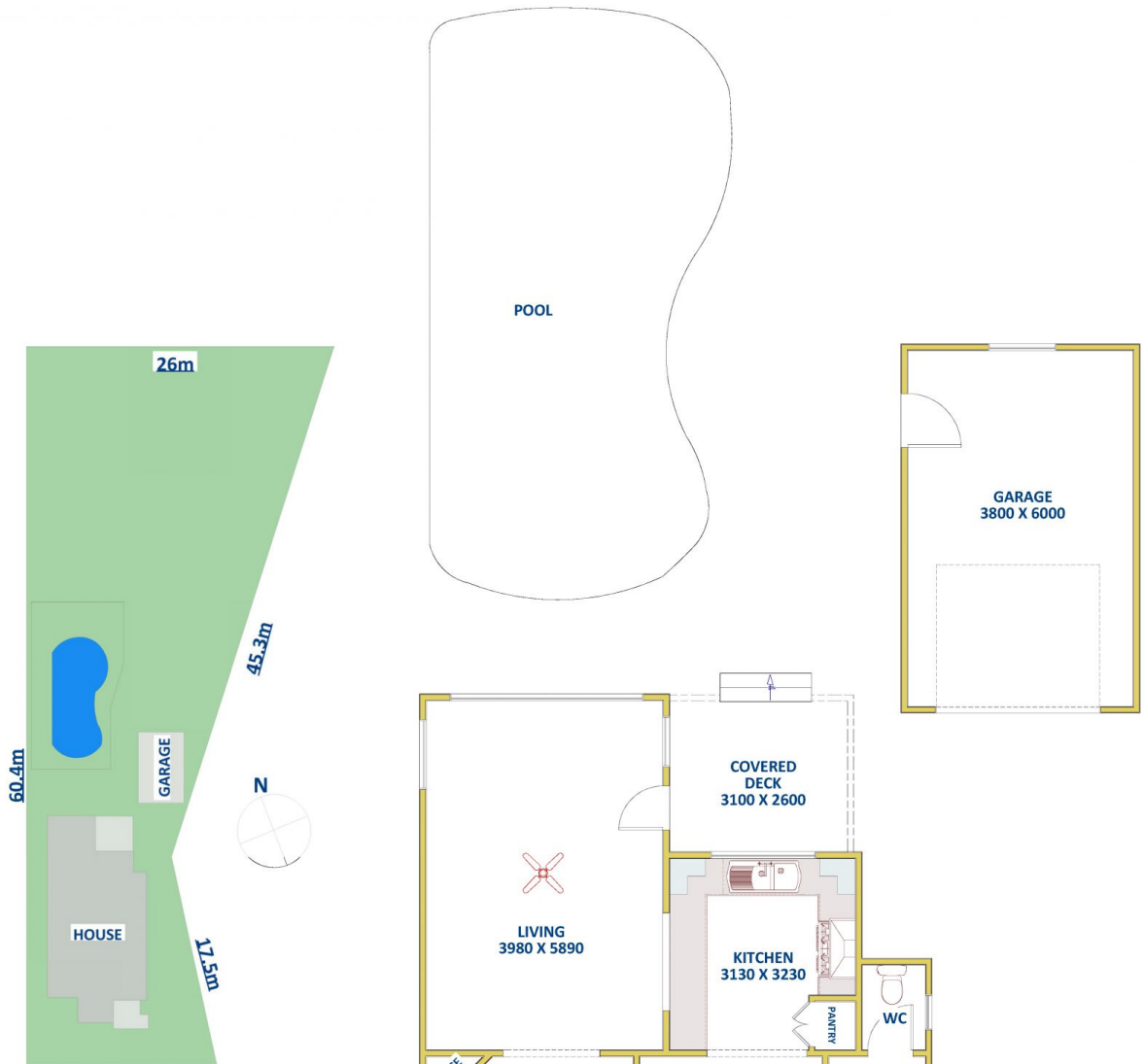
15.3m CHRISTO ROAD SITEMAP

SITE DIAGRAM **NOT TO SCALE** This drawing has been prepared for marketing purposes. Dimensions are a guide only.