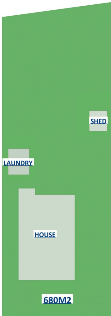
RAE STREET Site Map