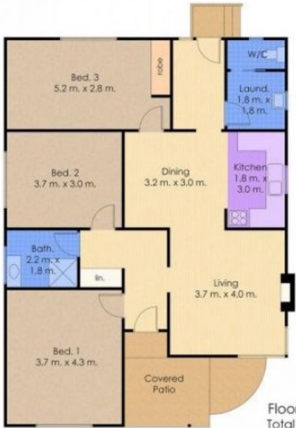
Floor Plan Total Internal Floor Area: 94 sqm