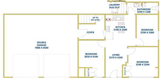
GROUND LEVEL DOUBLE GARAGE